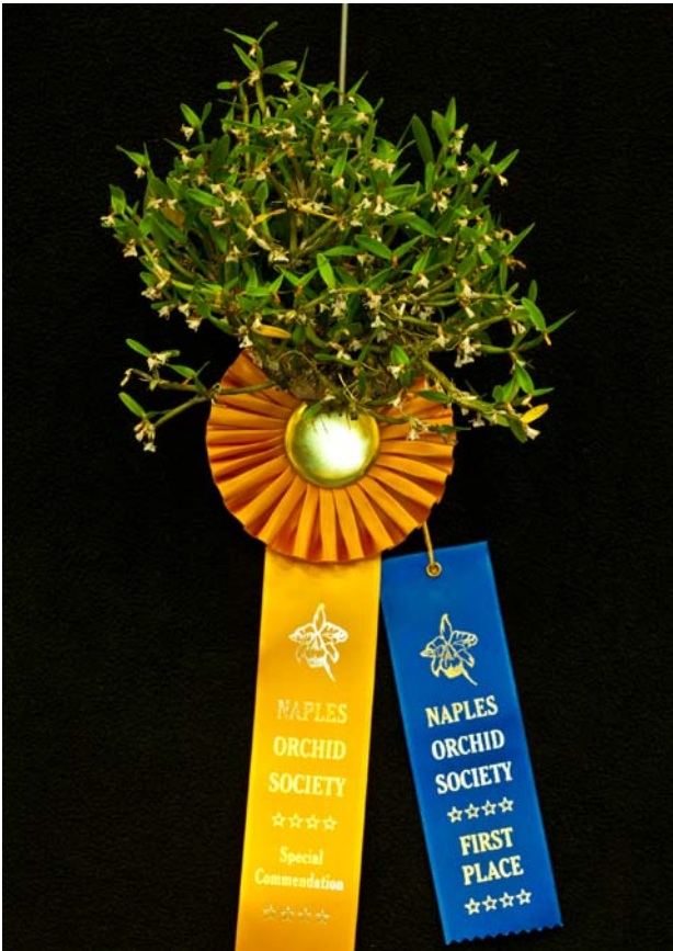
The Species Gold ribbon winner was: Scaphyglottis prolifera 'LeBuff' Owner: Kit Kitchen-Maran